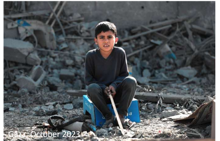
Gaza, October 2023