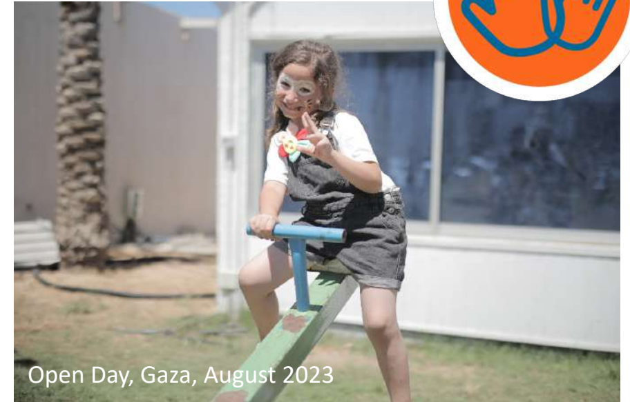
Open Day, Gaza, August 2023